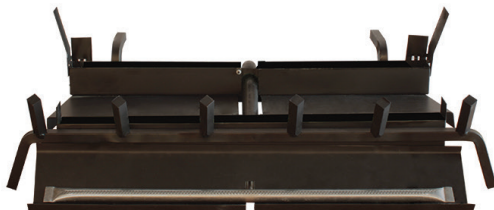
Triple Burner (AV)