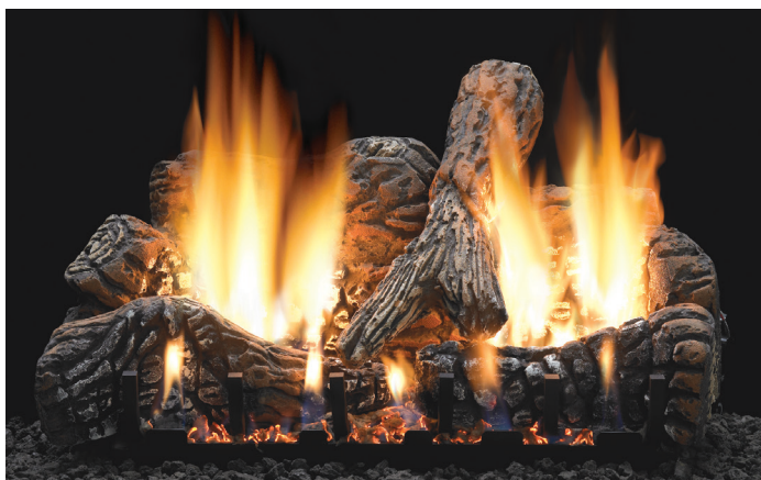
Ceramic Fiber Charred Oak Log Set (LS-24C2)