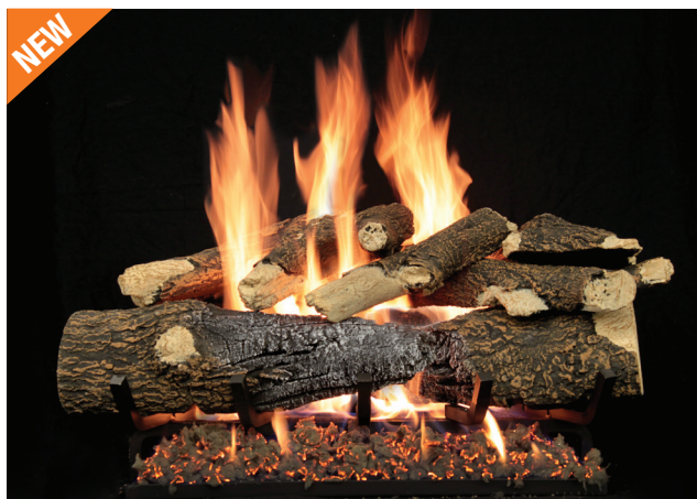
Frontier (LFR) Refractory Log Set