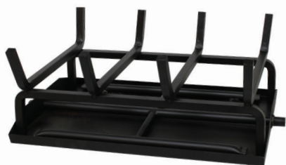
See-Through Burner (B3) (requires see-through log set)

* Accepts Manual and Millivolt Nat and LP accessory Valve Kits ** LP Conversion Kits available