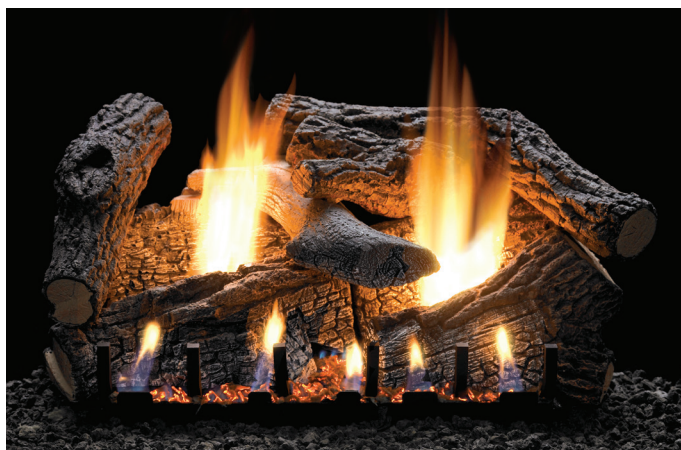
Refractory Super Sassafras Log Set (LS24RSS)