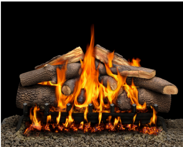
Advantage (LA) Refractory Log Set shown with Triple Burner