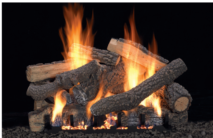
Refractory Ponderosa Log Set (LS24P)

Complete your fireplace with one of seven log sets – three styles in ceramic fiber and four in refractory concrete – each designed exclusively for the Slope Glaze Burner.