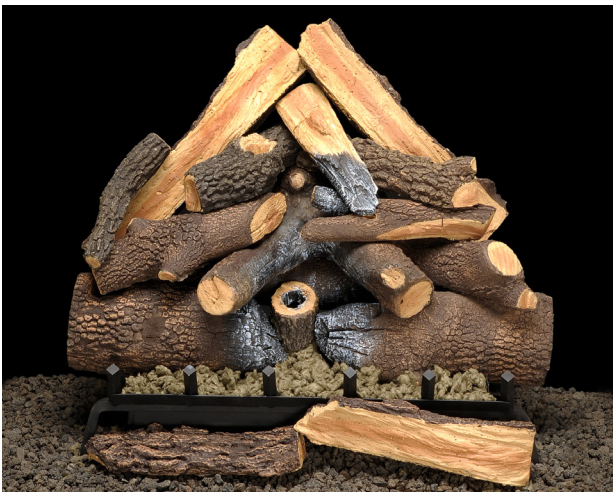
Advantage Refractory Log Set shown with Skyscraper (LAV) Accessory Refractory Logs