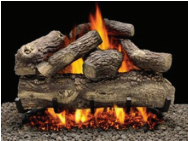
Treehouse 7 (LTH7) Refractory Log Set