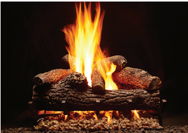
Great Lakes Oak (GLO) Refractory Log Set