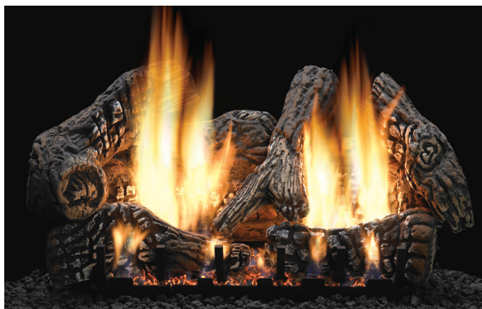
Ceramic Fiber Super Charred Oak Log Set (LS24C2S)