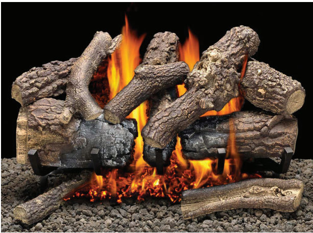
Treehouse 11 (LTH11) Refractory Log Set