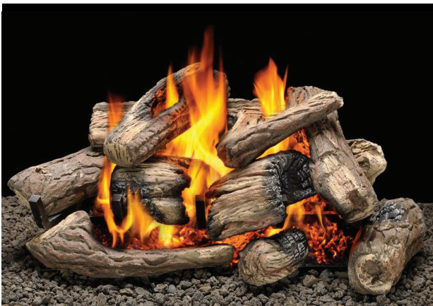
Kensington Forest (LKF) Ceramic Fiber Log Set