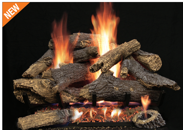
Pioneer (LPR) Refractory Log Set