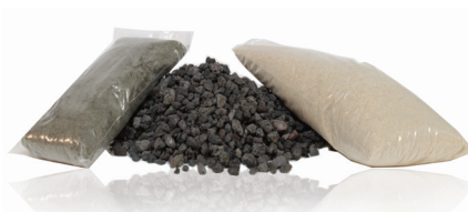
Embers, Rock and Sand included with all Double and See-Through Burners